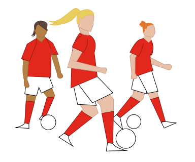
Offer at least 1 team in at least 4 of these age groups