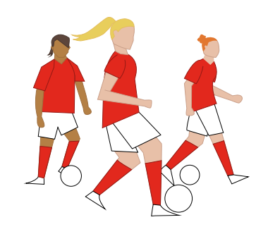
Must have at least 1 team in at least 4 of these age groups