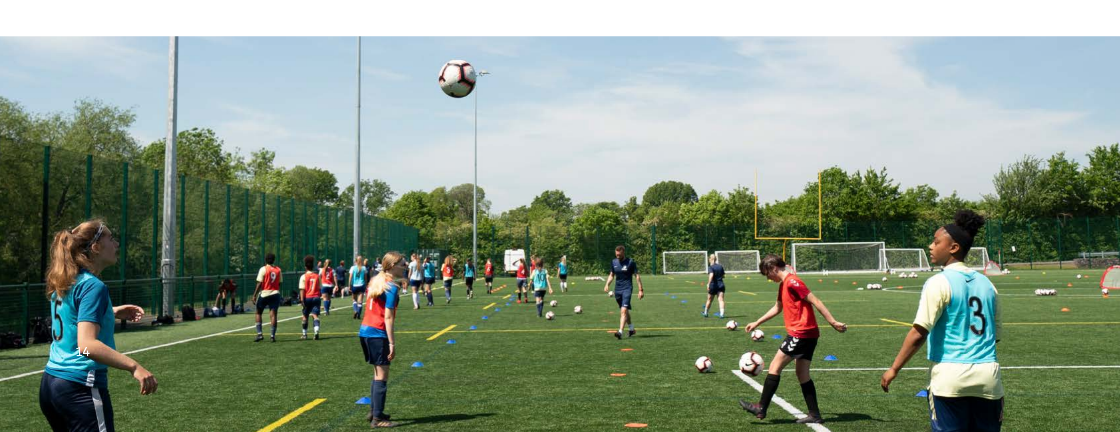
1 female team at any age